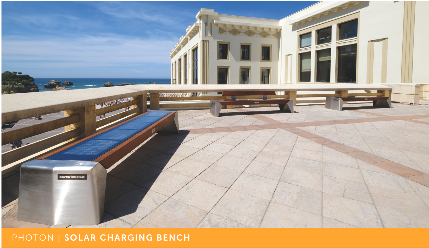
PHOTON | SOLAR CHARGING BENCH

An exceptionally stylish solar bench featuring natural wood side panels and either carbon steel or stainless steel ends.